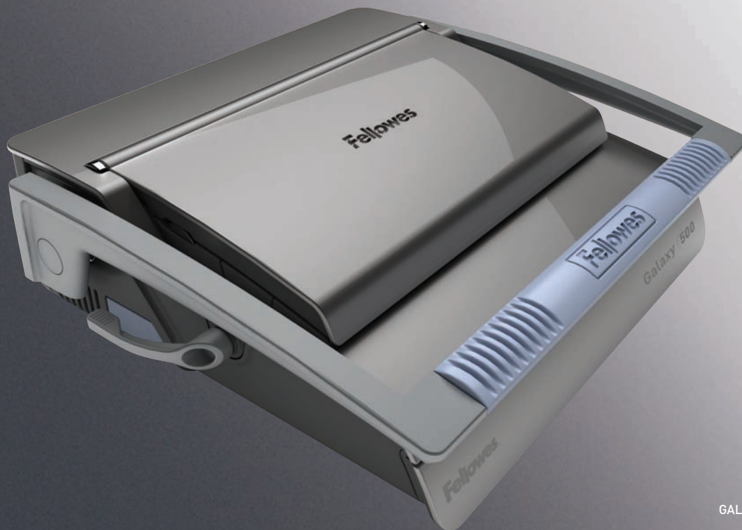
GALAXY 500 MODEL SHOWN