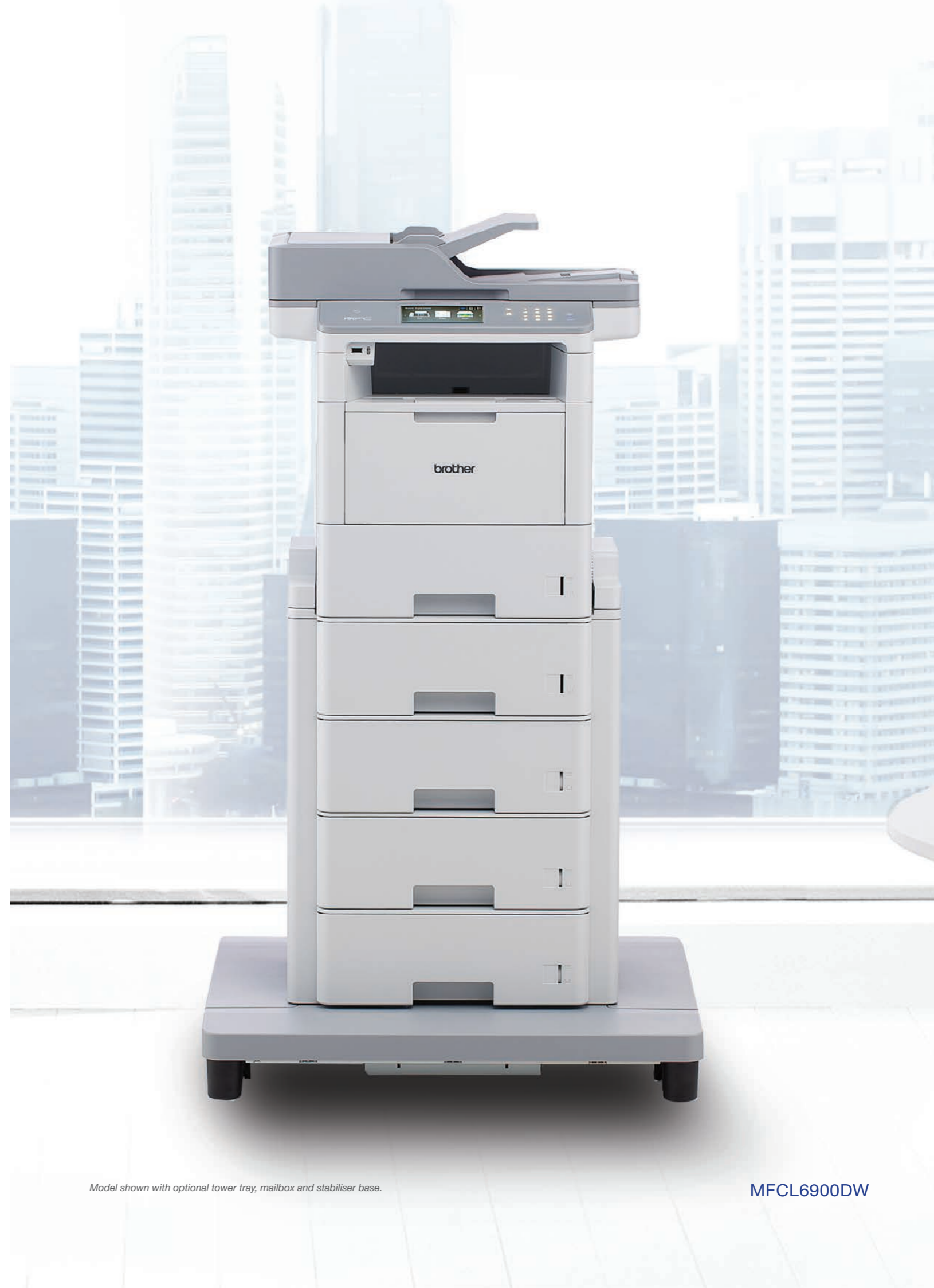
Model shown with optional tower tray, mailbox and stabiliser base.