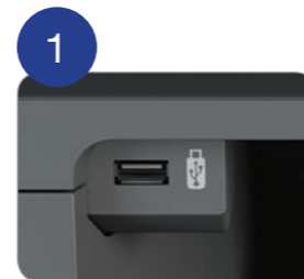
USB direct print*