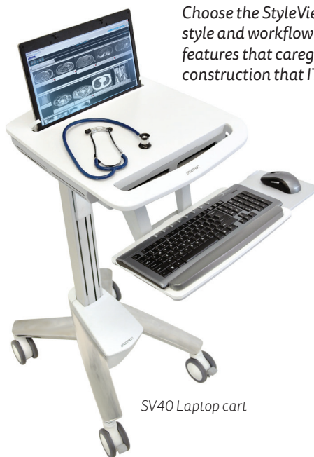
SV40 Laptop cart

Choose the StyleView medical cart that best meets your caregiving needs, style and workflow. Our market-leading StyleView carts include all the features that caregivers ask for, with all the open architecture and quality construction that IT departments require.