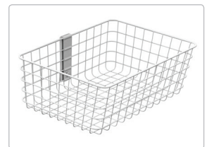
SV Wire Basket, Large

© 2018 Ergotron, Inc. 06/01/2018-EA Literature made in the U.S.A. Ergotron devices are not intended to cure, treat, mitigate or prevent any disease. StyleView is a registered trademark of Ergotron in the U.S.A. and China. Content is subject to change without notification