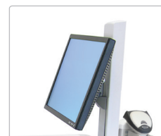
LCD Pivot: #SV41-6300-0