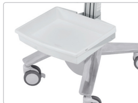
SV Front Tray