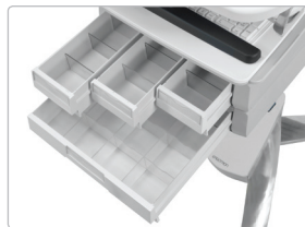
Several drawer configurations