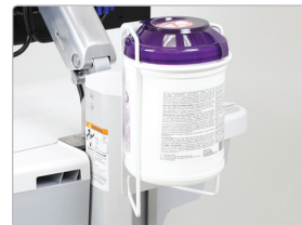
SV Sani-wipes Holder