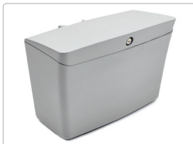
SV Storage Bin