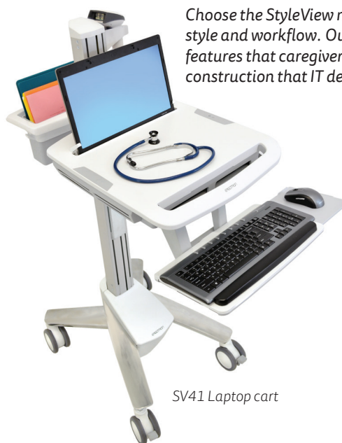
SV41 Laptop cart

Choose the StyleView medical cart that best meets your caregiving needs, style and workflow. Our market-leading StyleView carts include all the features that caregivers ask for, with all the open architecture and quality construction that IT departments require.