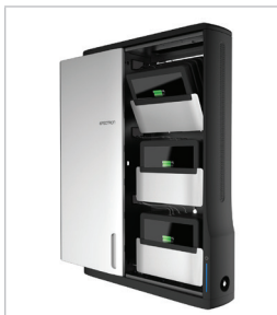
Zip12 Charging Wall Cabinet

Custom country-specific outlet strip includes plenty of space to work with oversized wall adapters and mini-bricks