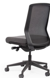
Motion Sync Reverse View