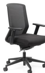
Motion Sync Optional Arms