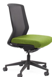
Motion Sync Motion Felt Seat Cover